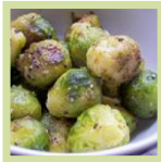
Roasted Brussel Sprouts Roasted brussels sprouts in olive oil.