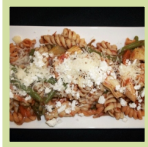
Roasted Vegetarian Pasta Roasted Veggies in a Tomato Basil Sauce, Topped with Three Cheeses