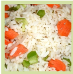
Garlic Mashed Potatoes or Savory Rice Pilaf Potatoes or Rice