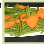
Green Beans & Carrots Steamed & served in creamy garlic butter