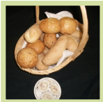
Assorted Breads, Buns & Butter Variety of fresh baked dinner rolls and breads