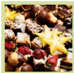
Assorted Christmas Squares