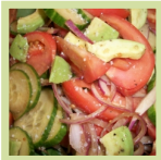
Spring Platter Salad Sliced red onion, cucumber, tomatoes and avocado in an olive oil and balsamic dressing .