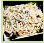
Creamy Pasta Salad Topped with fresh cut vegetables