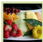
Fresh Seasonal Fruit Platter Selection of seasonal sliced fruit.