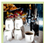
Fresh Ground Coffee 100% Columbian Coffee