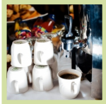
Fresh Ground Coffee 100% Columbian Coffee