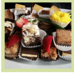
Dessert Platter A fine selection of cakes and squares