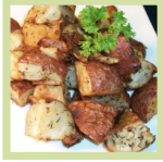
Roasted Red Potatoes Serves in garlic butter